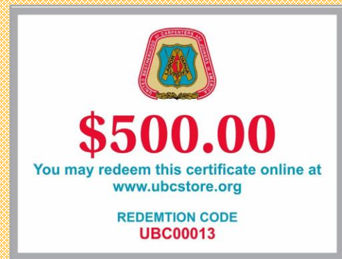
UBC Store Gift Card $500.00

Please contact Marc Shapiro directly for your selections