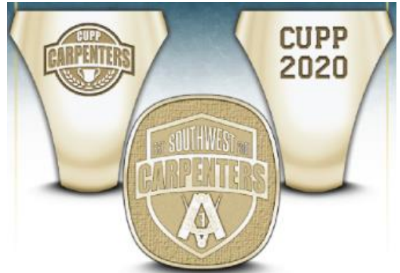
Sterling Silver Custom CUPP Ring Custom sized to fit