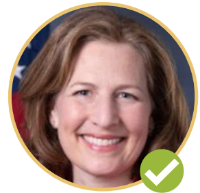
KIM SCHRIER U.S. CONGRESS DISTRICT 8