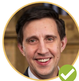
ALEX RAMEL HOUSE OF REPRESENTATIVES DISTRICT 40- POSITION 2