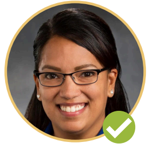
KRISTINE REEVES HOUSE OF REPRESENTATIVES DISTRICT 30 - POSITION 2