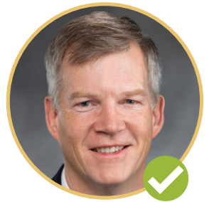
DAVE PAUL HOUSE OF REPRESENTATIVES DISTRICT 10 - POSITION 2