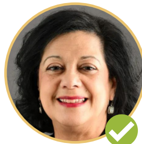
LILLIAN ORTIZ-SELF HOUSE OF REPRESENTATIVES DISTRICT 21 - POSITION 2