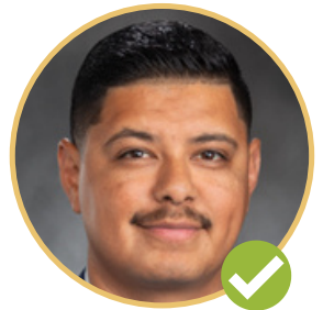
JULIO CORTES HOUSE OF REPRESENTATIVES DISTRICT 38 - POSITION 1