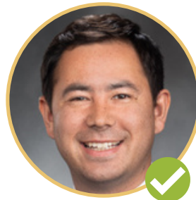
CLYDE SHAVERS HOUSE OF REPRESENTATIVES DISTRICT 10 - POSITION 1