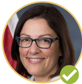
SUZAN DELBENE U.S. CONGRESS DISTRICT 1