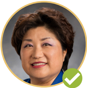
CINDY RYU HOUSE OF REPRESENTATIVES DISTRICT 32 - POSITION 1