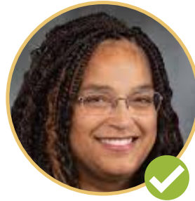
BRANDY DONAGHY HOUSE OF REPRESENTATIVES DISTRICT 44 - POSITION 1