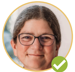
LISA PARSHLEY HOUSE OF REPRESENTATIVES DISTRICT 22 - POSITION 2