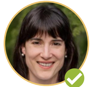
MARIE GLUESENKAMP PEREZ U.S. CONGRESS DISTRICT 3