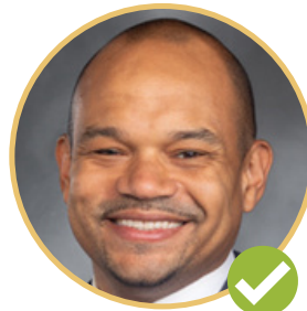
CHIPALO STREET HOUSE OF REPRESENTATIVES DISTRICT 37 - POSITION 2