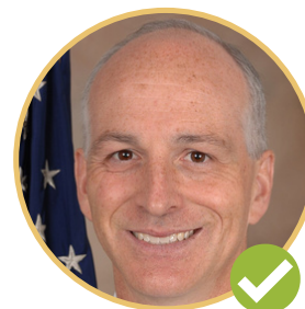
ADAM SMITH U.S. CONGRESS DISTRICT 9