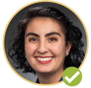
DARYA FARIVAR HOUSE OF REPRESENTATIVES DISTRICT 46 - POSITION 2