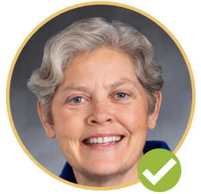
LAURIE JINKINS HOUSE OF REPRESENTATIVES DISTRICT 27 - POSITION 1