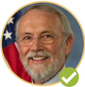
DAN NEWHOUSE U.S. CONGRESS DISTRICT 4