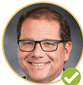
STROM PETERSON HOUSE OF REPRESENTATIVES DISTRICT 21- POSITION 1