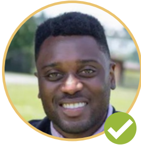
SHAUN SCOTT HOUSE OF REPRESENTATIVES DISTRICT 43 - POSITION 2