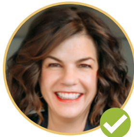
APRIL CONNORS HOUSE OF REPRESENTATIVES DISTRICT 8 - POSITION 2