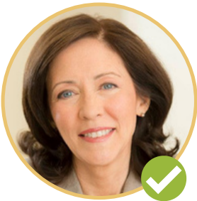
MARIA CANTWELL U.S. SENATE WASHINGTON