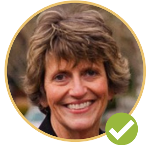
LISA CALLAN HOUSE OF REPRESENTATIVES DISTRICT 5 - POSITION 2