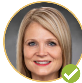
JACQUELIN MAYCUMBER U.S. CONGRESS DISTRICT 5