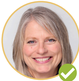
MOLLY MARSHALL SPOKANE COUNTY COMMISSIONER DISTRICT 5