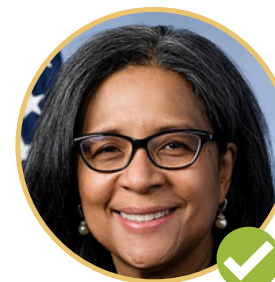
MARILYN STRICKLAND U.S. CONGRESS DISTRICT 10