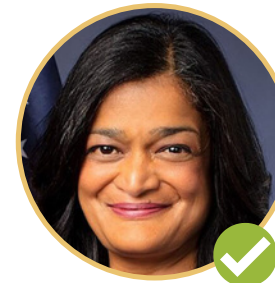
PRAMILA JAYAPAL U.S. CONGRESS DISTRICT 7