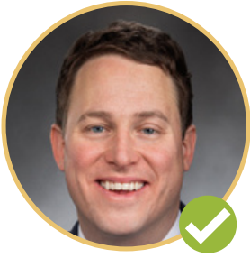
JOE TIMMONS HOUSE OF REPRESENTATIVES DISTRICT 42 - POSITION 2