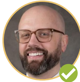
CAMERON SEVERNS HOUSE OF REPRESENTATIVES DISTRICT 25 - POSITION 1