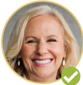
MARI LEAVITT HOUSE OF REPRESENTATIVES DISTRICT 28 - POSITION 1