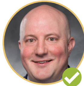
DAN BRONOSKE HOUSE OF REPRESENTATIVES DISTRICT 28 - POSITION 2